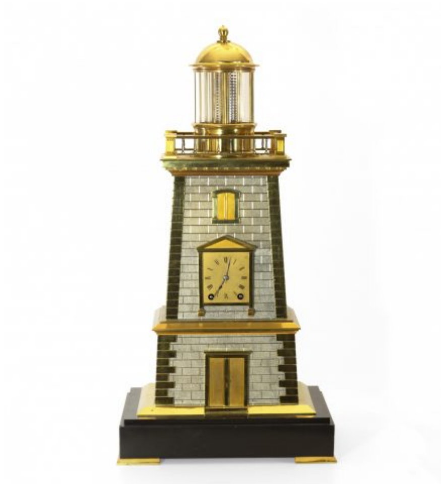
Antique clock automaton by Guilmet, France