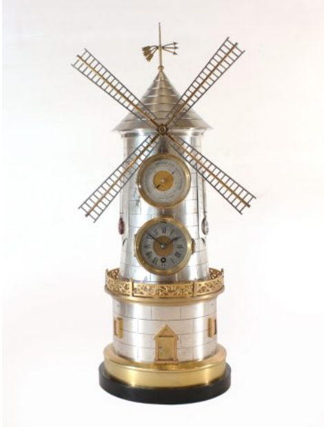
Guilmet Industrial clock automaton

Also in stock from Guilmet's industrial clock automata series are: