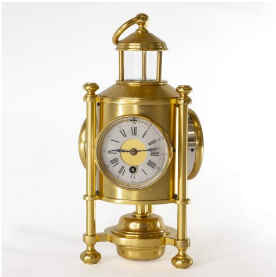
Guilmet 'Davy lamp' from his industrial series of novelty clocks